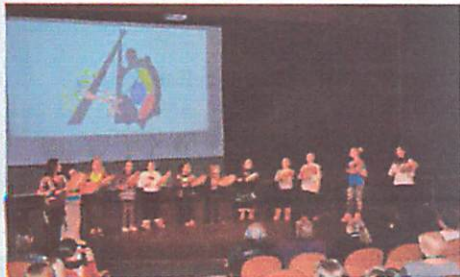
Migwannanse (Little Eagle Feather) Drum Group from East View with Desire Mitchell.