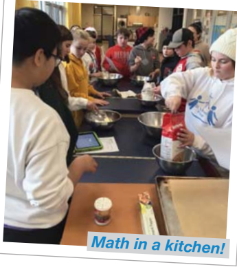
Math in a kitchen!

Our 7-12 program provides students with a gradual transition into secondary school. Students experience elements of secondary school which makes the transition to high school seamless as they have already been exposed to the school culture and environment. Grade 7 and 8 students are treated to specialty learning rooms, their own locker, a cafeteria, superior athletic facilities, extra-curricular clubs/teams and technology that supports their success. The grade 7 and 8 curriculum expectations are the same for all ADSB students. However, the curriculum in a 7-12 school can be taught differently because of the access to specialty facilities and subject-specific teachers . Students experience Rotary in their timetable which mirrors secondary school routines.