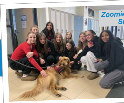
Zoomie the therapy dog = Superior Smiles