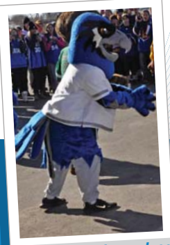
Stan our hyped up Steelhawk!

Phone: 705-945-7177 ext. 70510 Fax: 705-945-7170