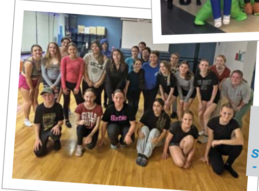
Grade 7-9 Junior Dance Team in our Superior Facility - Dance Studio!