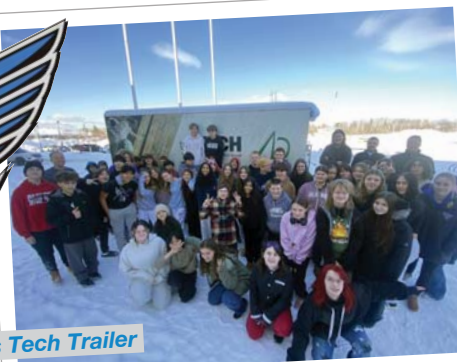
ADSB's Tech Trailer