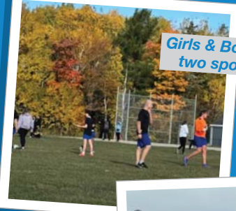
Girls & Boys Soccer Teams: two sports fields on site