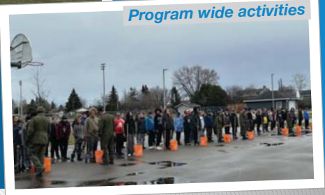
Program wide activities