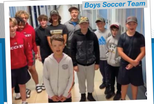
Boys Soccer Team

COME FIND OUT WHAT MAKES SUPERIOR HEIGHTS SUPERIOR!