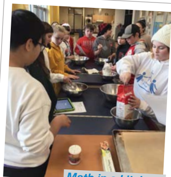
Math in a kitchen!

Our 7-12 program provides students with a gradual transition into secondary school. Students experience elements of secondary school which makes the transition to high school seamless as they have already been exposed to the school culture and environment. Grade 7 and 8 students are treated to specialty learning rooms, their own locker, a cafeteria, superior athletic facilities, extra-curricular clubs/teams and technology that supports their success. The grade 7 and 8 curriculum expectations are the same for all ADSB students. However, the curriculum in a 7-12 school can be taught differently because of the access to specialty facilities and subject-specific teachers . Students experience Rotary in their timetable which mirrors secondary school routines.