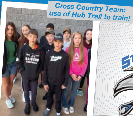
Cross Country Team: use of Hub Trail to train!