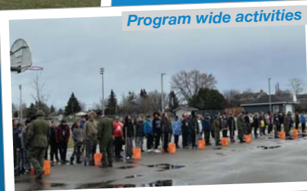
Program wide activities