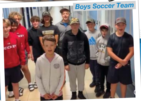
Boys Soccer Team

COME FIND OUT WHAT MAKES SUPERIOR HEIGHTS SUPERIOR!