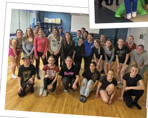
Grade 7-9 Junior Dance Team in our Superior Facility - Dance Studio!