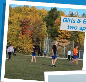
Girls & Boys Soccer Teams: two sports fields on site