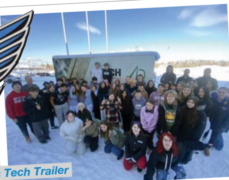
ADSB's Tech Trailer